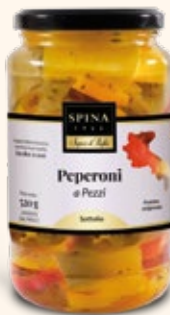
Peperoni a pezzi Peppers in pieces CODE: VCO194 - 520 g