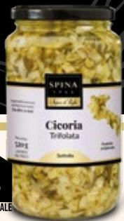
Cicoria cimata trifolata classica/picante Sautéed Chicory (classic/spicy) CODE: VCO043 - 520 g