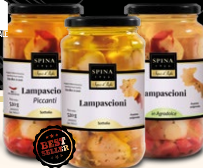
Lampascioni classici/piccanti/agrodolce "Lampascioni" (classic/spicy/sweet and sour) CODE: VCO167 | VCO168 | VCO030 - 520 g