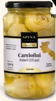
Carciofini interi n.15 Whole baby artichokes 15 pieces CODE: VCO019 - 520 g