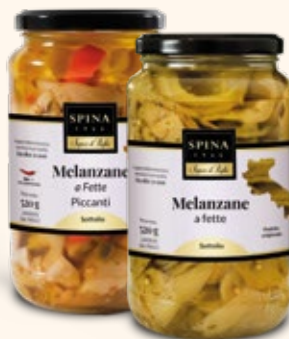
Melanzane a fette classiche/piccanti Sliced aubergines (classic/spicy) CODE: VCO175 | VCO176 - 520 g