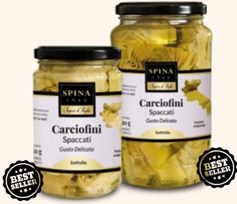
Carciofini spaccati gusto delicato classici/piccanti Sliced baby artichokes delicate taste (classic/spicy) CODE: VCO026 - 280 g CODE: VCO028 - 520 g