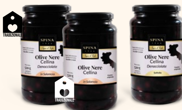
Olive nere "Cellina" salamoia/sottolio 520 g "Cellina" black olives (in brine/in olive oil) Salamoia intere/whole in brine: CODE: VCL029 Salamoia denocciolate/pitted in brine: CODE: VCL058 Sottolio denocciolate/pitted in olive oil: CODE: VCL059 / 490 g