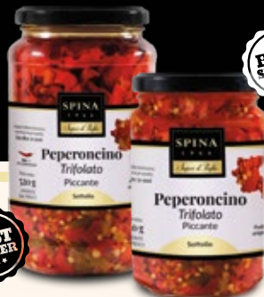
Peperoncino trifolato Spicy sautéed chili pepper CODE: VCO205 - 280 g CODE: VCO206 - 520 g