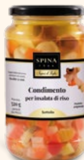
Condimento per insalata di riso in olio Rice seasoning in oil CODE: VCO058 - 520 g