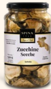
Zucchine secche Sundried courgettes CODE: VCO223 - 520 g