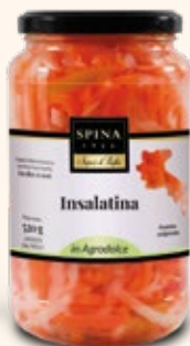
Insalatina in agrodolce Vegetables fillets sweet and sour CODE: VCA026 - 520 g