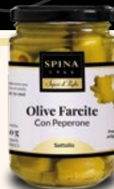
Olive verdi farcite Stuffed green olives CODE: VCL009 - 280 g