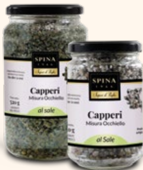
Capperi al sale misura occhio C.5/6 Salty capers small size (C. 5/6) CODE: VCN009 - 250 g CODE: VCN010 - 450 g