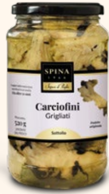
Carciofini grigliati Grilled baby artichokes CODE: VCG001 - 520 g