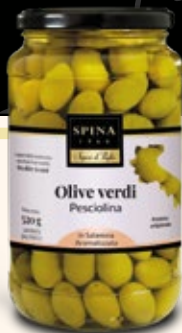
Olive verdi Pesciolina "Pesciolina" green olives CODE: VCL027 - 520 g