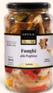
Funghi alla Pugliese "Apulian taste" Mushrooms CODE: VCO314 - 520 g