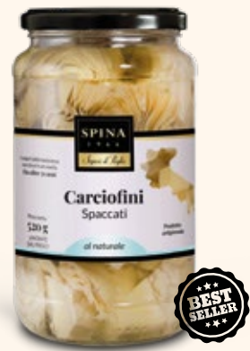
Carciofini spaccati al naturale Natural sliced baby artichokes CODE: VCN013 - 520 g