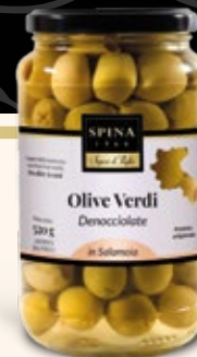
Olive verdi denocciolate in salamoia Pitted green olives in brine CODE: VCL031 - 520 g