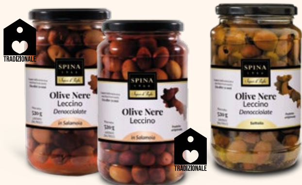
Olive nere "Leccino" salamoia/sottolio 520 g "Leccino" black olives (in brine/in oil) 520 g Salamoia intere/whole in brine: CODE: VCL022 Denocciolate/pitted in brine: CODE: VCL050 Denocciolate/pitted in oil: CODE: VCL054 / 490 g