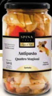
Antipasto Quattro Stagioni "Four seasons" appetizer CODE: VCO014 - 520 g