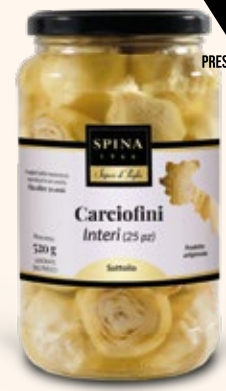
Carciofini interi n.20/25 Whole baby artichokes 20/25 pieces CODE: VCO258 - 520 g