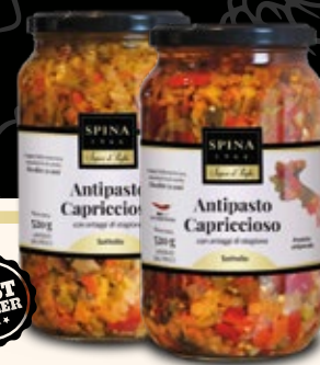
Antipasto Capriccioso classico/picante "Bruschetta Capriccioso" (classic/spicy) CODE: VCO007 | VCO008 - 520 g