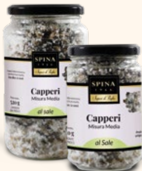
Capperi al sale misura media C.8 Salty capers medium size (C. 8) CODE: VCN005 - 250 g CODE: VCN006 - 400 g