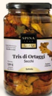
Tris di ortaggi secchi Trio of sundried vegetables CODE: VCO219 - 520 g