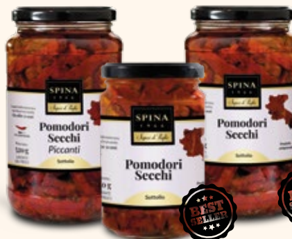
Pomodori secchi classici/piccanti Sundried tomatoes (classic/spicy) CODE: VCO209 - 280 g CODE: VCO211 | VCO212 - 520 g