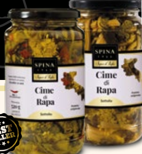
Cime di rapa classiche/piccanti Apulian turnip tops (classic/hot) CODE: VCO051 | VCO052 - 520 g