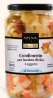
Condimento per insalata di riso leggero Natural rice seasoning CODE: VCN020 - 520 g