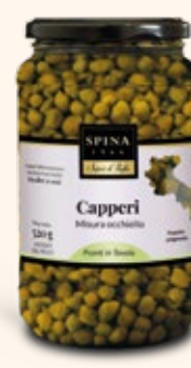
Capperi pronti in tavola misura occhio C.5/6 Capers ready to serve small size (C.5/6) CODE: VCA010 - 520 g