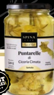
Puntarelle di cicoria Chicory "puntarelle" CODE: VCO038 - 450 g