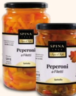
Peperoni a filetti Pepper fillets CODE: VCO197 - 280 g CODE: VCO198 - 520 g