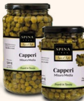
Capperi pronti in tavola misura media C.8 Capers ready to serve medium size (C. 8) CODE: VCA005 - 280 g CODE: VCA006 - 450 g