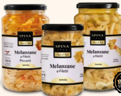
Melanzane a filetti classiche/piccanti Aubergine fillets (classic/spicy) CODE: VCO181 - 280 g CODE: VCO183 | VCO184 - 520 g