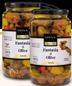
Fantasia di olive classiche/piccanti Mixed Olives (classic/spicy) CODE: VCL003 | VCL004 - 520 g