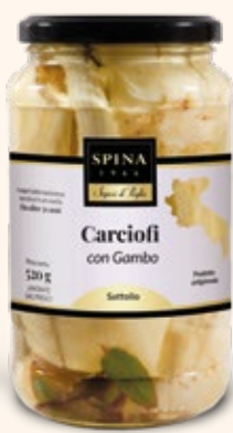
Carciofi con gambo Artichokes with stem CODE: VCO243 - 520 g