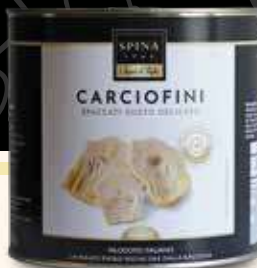
Carciofini Spaccati Gusto Delicato Sliced baby artichokes delicate taste CODE: LCL004 - 2600g