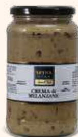
Crema di Melanzane Aubergines Patè CODE: FSE008 - 520g