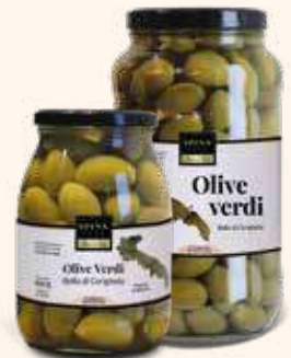
Olive verdi "Bella di Cerignola" in salamoia Green Olives "Belladi Cerignola" in brine CODE: VCL075 (2900g) - VCL056 (950g)