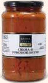
Crema di Pomodori Secchi Sundried Tomatoes Patè CODE: FSE005 - 520g