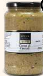
Crema di Carciofi Artichokes Patè CODE: FSE002 - 520g