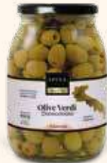
Olive verdi denocc. in salamoia Pitted green olives in brine CODE: VCL033 - 950g