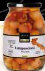
Lampascioni piccanti "Lampascioni" (spicy) CODE: VCO170 - 950g