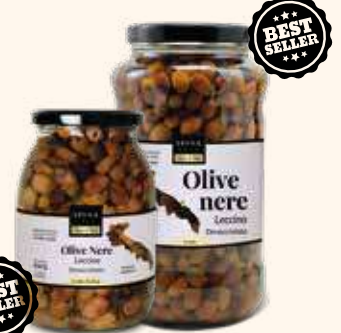
Olive nere Leccino denocc. in olio Pitted "Leccino" black olives in oil CODE: VCL055 - 950g | VCL057 - 2900g