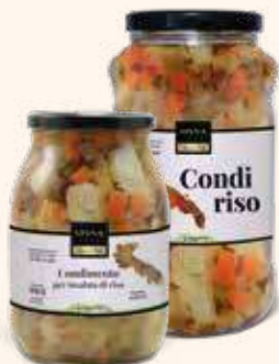
Condimento per Insalata di Riso Leggero Natural rice seasoning CODE: VCN021 - 950g | VCN022 - 2900g