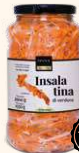
Insalatina in agrodolce Vegetables fillets sweet and sour VCA028 - 2900g