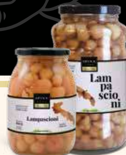
Lampascioni in agrodolce "Lampascioni" (sweet and sour) CODE: VCA031 - 950g | VCA032 - 2900g