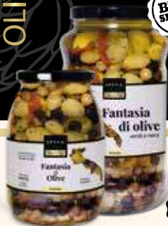
Fantasia di olive Mixed Olives CODE: VCL005 - 950g | VCL007 - 2900g