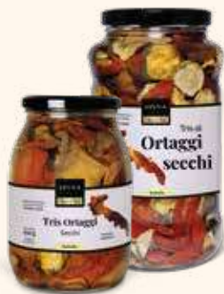
Tris di ortaggi secchi Trio of sundried vegetables CODE: VCO220 - 950g | VCO221 - 2900g