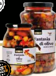
Fantasia di olive piccanti Mixed Olives (spicy) CODE: VCL006 - 950g | VCL008 - 2900g