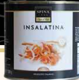
Insalatina in Agrodolce Vegetables fillets sweet and sour CODE: LCL005 - 2600g