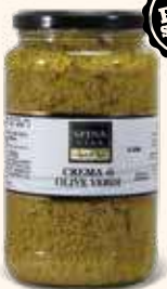
Crema di Olive Verdi Green Olives Patè CODE: FSE004 - 520g