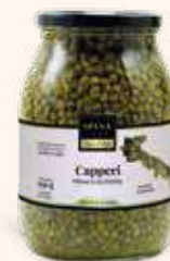
Capperi pronti in tavola m. occhio C.5/6 Capers ready to serve small size (C.5/6) CODE: VCA011 - 950g