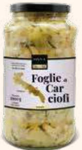
Foglie di carciofi in olio Artichokes leaves in oil VCO036 - 2900g