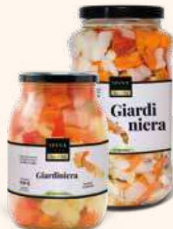
Giardiniera in agrodolce Mixed vegetables sweet and sour CODE: VCA023 - 950g | VCA024 - 2900g