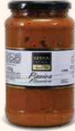
Pizzica Pizzica Mixed Vegetable Patè with Chili Peppers CODE: FSE007 - 520g