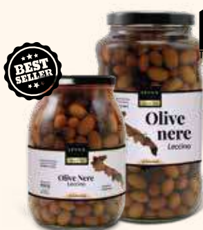
Olive nere Leccino in salamoia "Leccino" black olives in brine CODE: VCL023 - 950g | VCL024 - 2900g