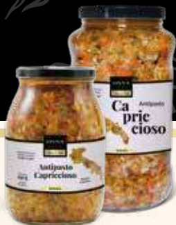
Antipasto Capriccioso "Bruschetta Capriccioso" CODE: VCO009 - 950g | VCO011-2900g