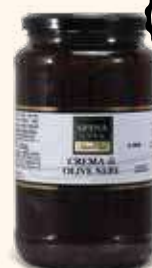
Crema di Olive Nere Black Olives Patè CODE: FSE003 - 520g