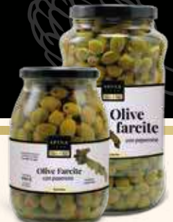
Olive verdi farcite Stuffed green olives CODE: VCL011 - 950g | VCL012 - 2900g