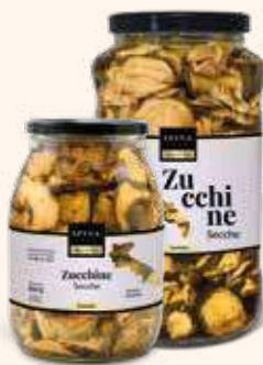
Zucchine secche Sundried courgettes CODE: VCO224 - 950g | VCO225 - 2900g