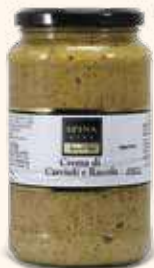
Crema di Carciofi e Rucola Artichokes Patè with Rocket CODE: FSE006 - 520g