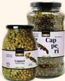
Capperi pronti in tavola m. media C.8 Capers ready to serve medium size (C.8) CODE: VCA007 - 950g | VCA008 - 2900g