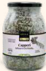
Capperi al sale m. occhio C.5/6 Salty capers small size (C.5/6) CODE: VCN011 - 800g