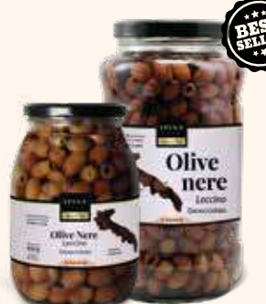
Olive nere Leccino denocc. in salamoia Pitted "Leccino" black olives in brine CODE: VCL063 - 950g | VCL048 - 2900g