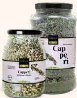
Capperi al sale m. media C.8 Salty capers medium size (C.8) CODE: VCN007 - 800g | VCN008 - 2750g