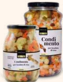
Condimento per Insalata di Riso in olio Rice seasoning in oil CODE: VCO059 - 950g | VCO060 - 2900g