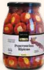
Peperoncino Ripieno Filled Chili Peppers VCO247 - 960g