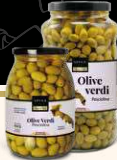
Olive verdi Pesciolina "Pesciolina" green olives CODE: VCL018 - 950g | VCL028 - 2900g