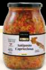
Antipasto Capriccioso piccante "Bruschetta Capriccioso" ( spicy ) CODE: VCO010 - 950g