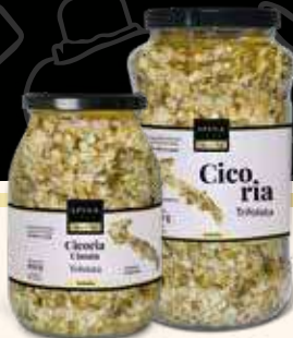
Cicoria cimata trifolata Sautéed chicory CODE: VCO045 - 950g | VCO047 - 2900g