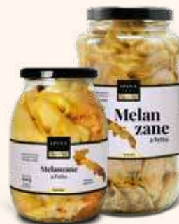
Melanzane a fetta Sliced aubergines CODE: VCO177 - 950g | VCO179 - 2900g