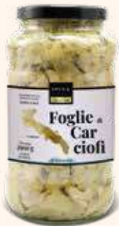
Foglie di carciofi al naturale Artichokes leaves natural VCN018 - 2900g