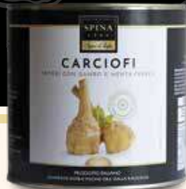
Carciofi con Gambo in Olio Artichokes with stem CODE: LCL001 (15/16 PZ) LCL002 (20/21 PZ) - 2600g