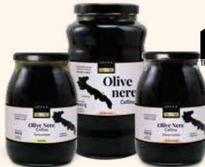
Olivenero Cellina | "Cellina" black olives Intere in salamoia/whole in brine - VCL030 - 2900g Denocciate in salamoia/pitted in brine - VCL047 - 950g Denocciate in olio/pitted in oil - VCL060 - 950g