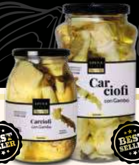
Carciofi con gambo alla brindisina Artichokes with stem Brindisi style CODE: VCO327 - 950g | VCO326 - 2900g