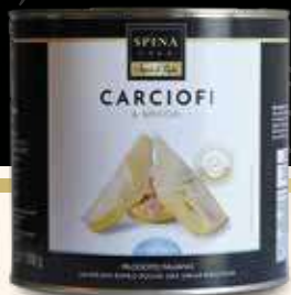
Carciofi a Spicchi al Naturale Natural sliced artichokes CODE: LCL003 - 2600g