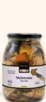
Melanzane secche Sundried aubergines CODE: VCO191 - 950g