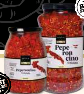
Peperoncino trifolato piccante Sautéed chili pepper ( spicy ) CODE: VCO207 - 950g | VCO208 - 2900g