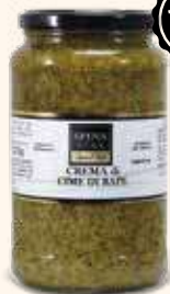
Crema di Cime di Rapa Turnip Tops Patè CODE: FSE001 - 520g